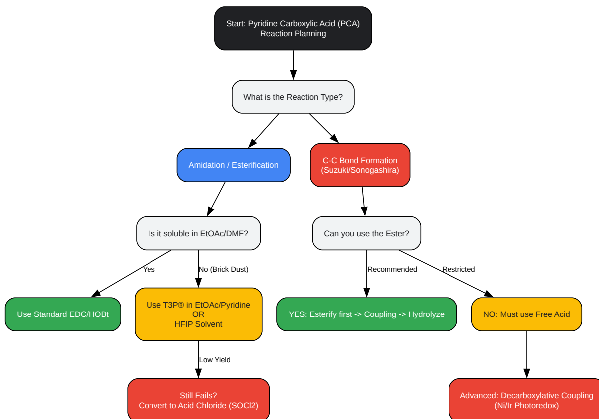
Figure 2: Strategic Decision Tree for PCA Functionalization.

Click to download full resolution via product page