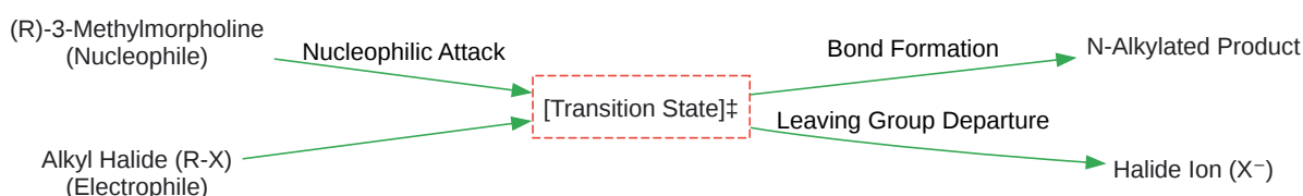
Diagram 2: Signaling Pathway of Nucleophilic Substitution (SN2)

Click to download full resolution via product page