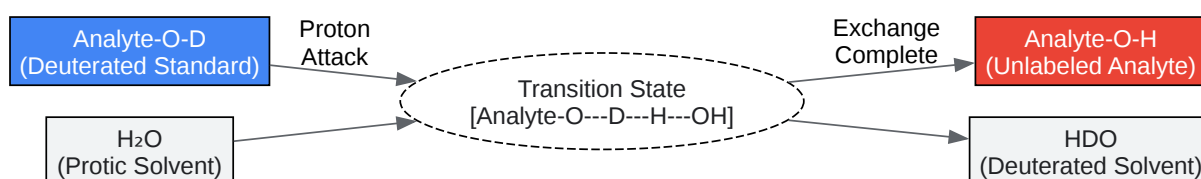
Diagram of H/D Back-Exchange Mechanism: