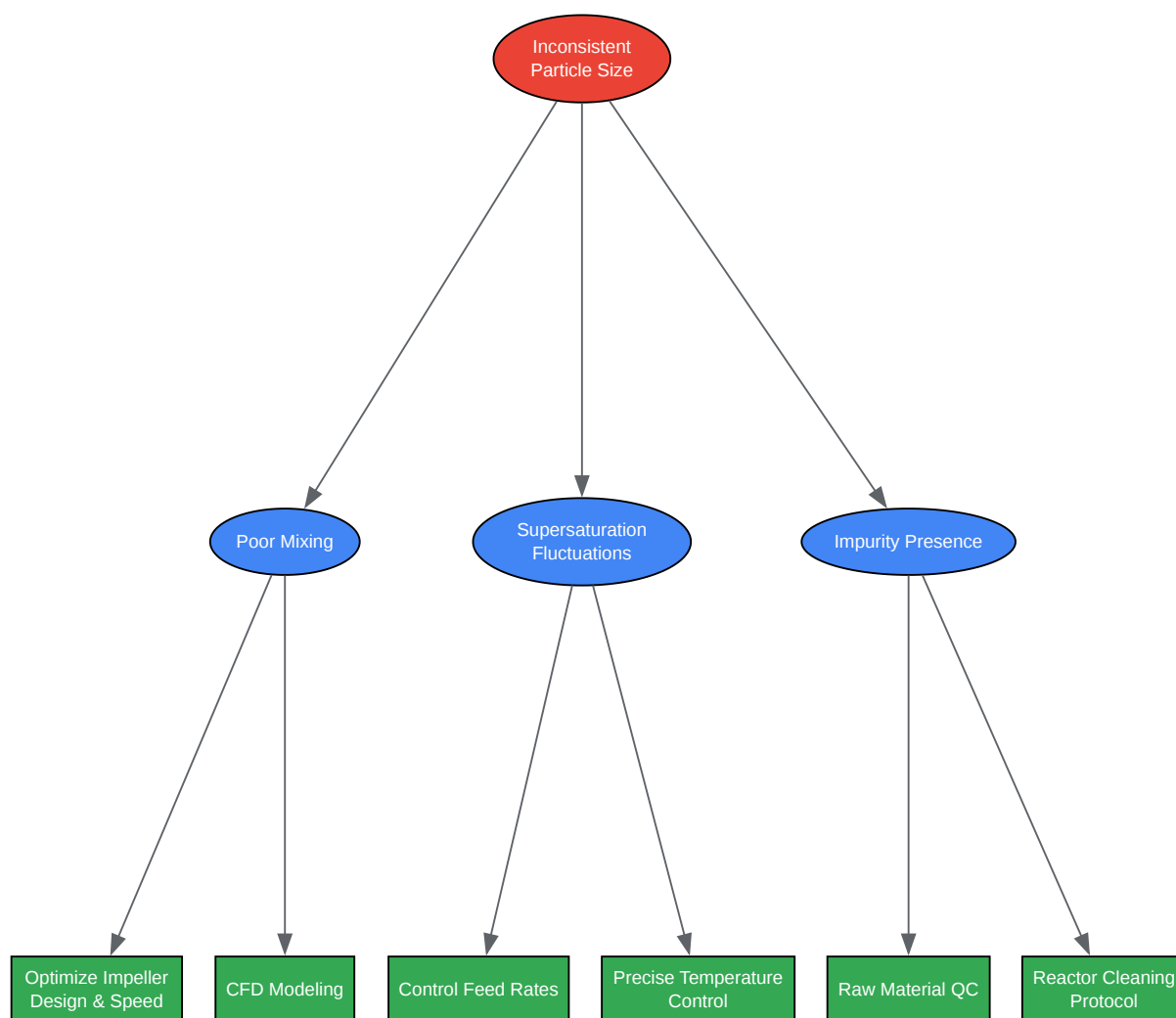
Diagram 2: Logical Relationship of Troubleshooting Particle Size Issues

Click to download full resolution via product page