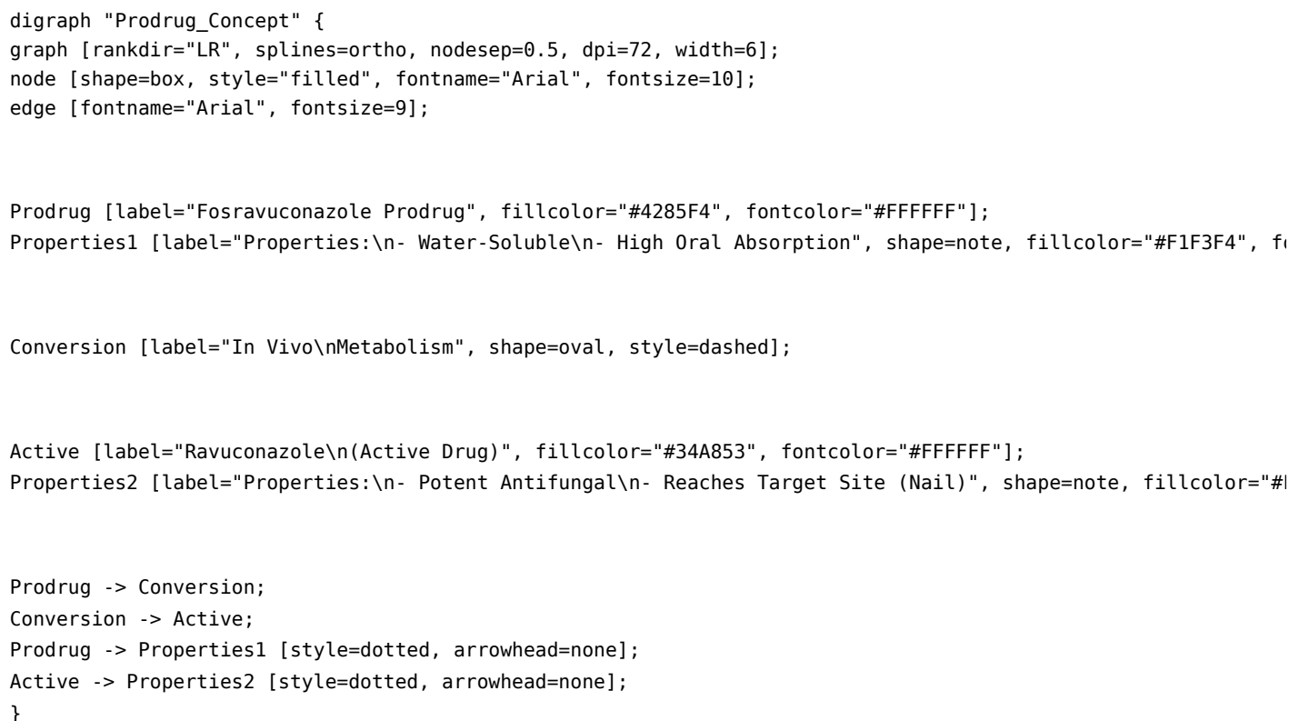
Fig. 3: Logical relationship of fosravuconazole prodrug to its active moiety.