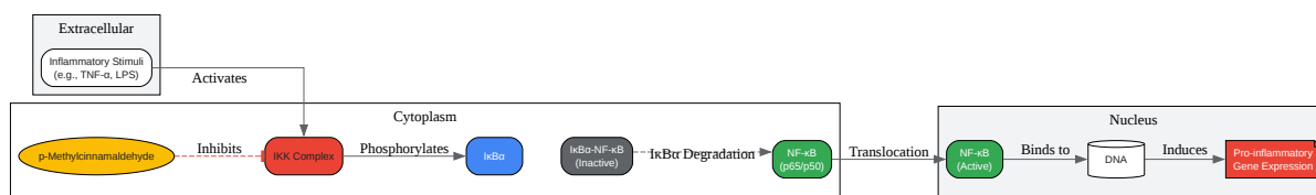
Diagram of the Proposed NF- \kappa B Inhibitory Pathway of p-Methylcinnamaldehyde

Click to download full resolution via product page