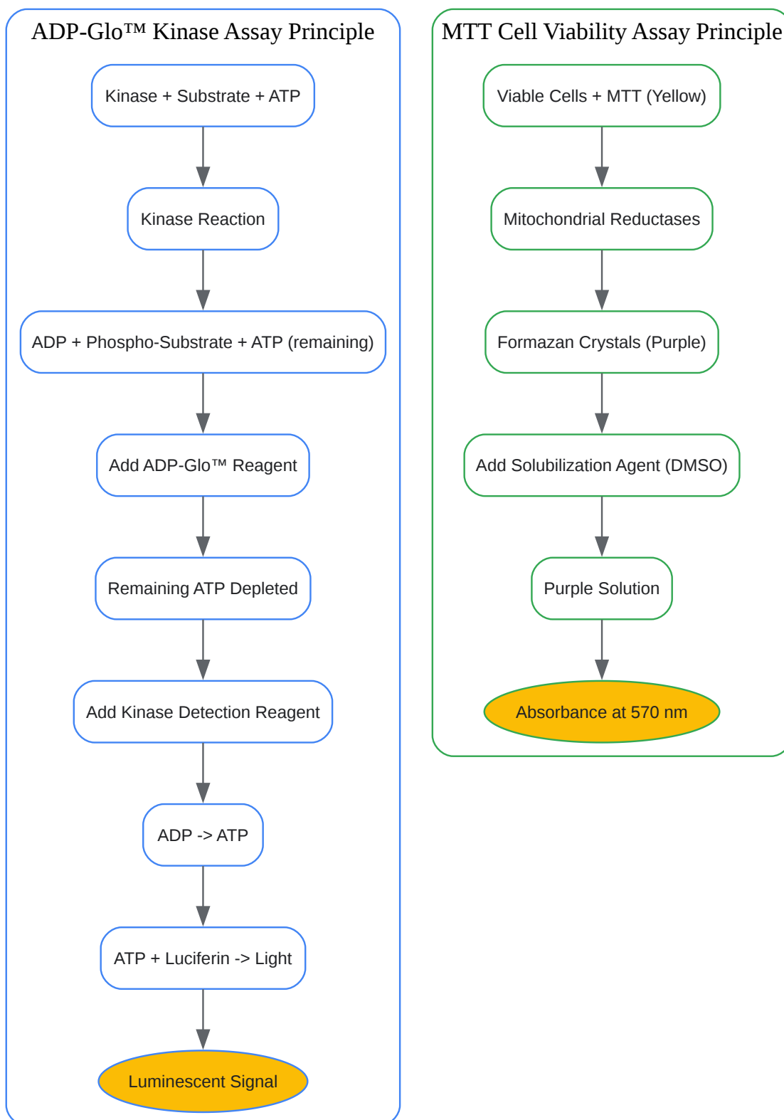
Caption: A generalized workflow for the high-throughput screening of an isoxazole library.

Click to download full resolution via product page