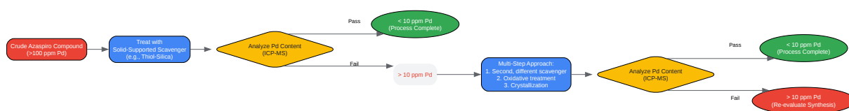
Diagram 1: Decision Tree for Palladium Removal Strategy

Click to download full resolution via product page