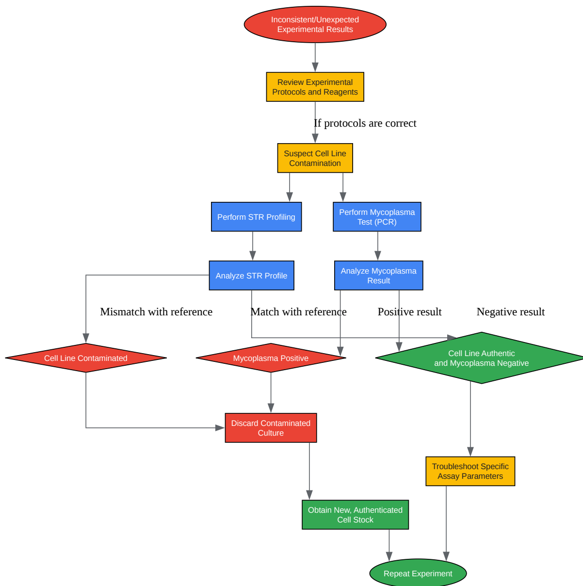
Caption: Proposed mechanism of Trigoxypin A -induced apoptosis via inhibition of the PI3K/Akt/NF-κB pathway.