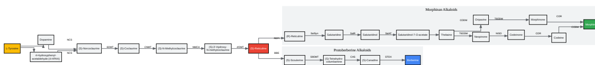
Figure 1: Overview of the biosynthetic pathway of benzyltetrahydroisoquinoline alkaloids.