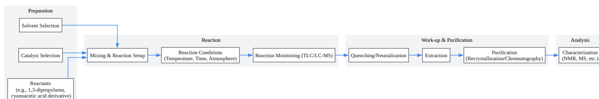
Diagram 1: General Experimental Workflow for Synthesis

Click to download full resolution via product page