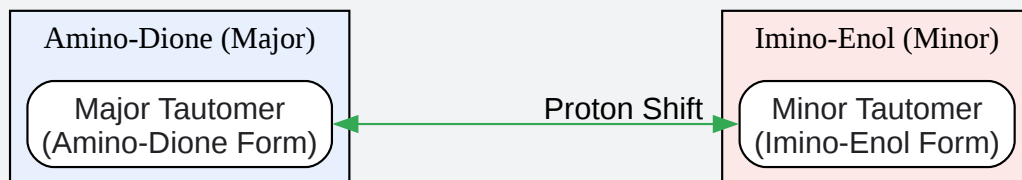
Fig. 1: Tautomeric equilibrium of the uracil core.