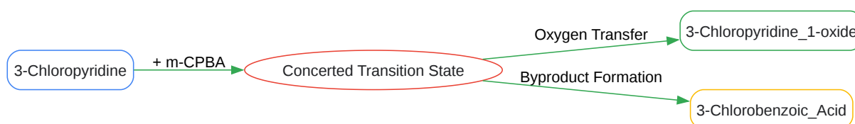
Diagram of the m-CPBA Oxidation Pathway

Click to download full resolution via product page