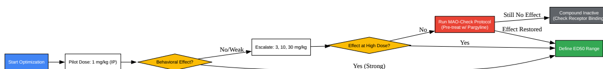
Figure 1: Dose Escalation & Metabolic Validation Workflow

Click to download full resolution via product page