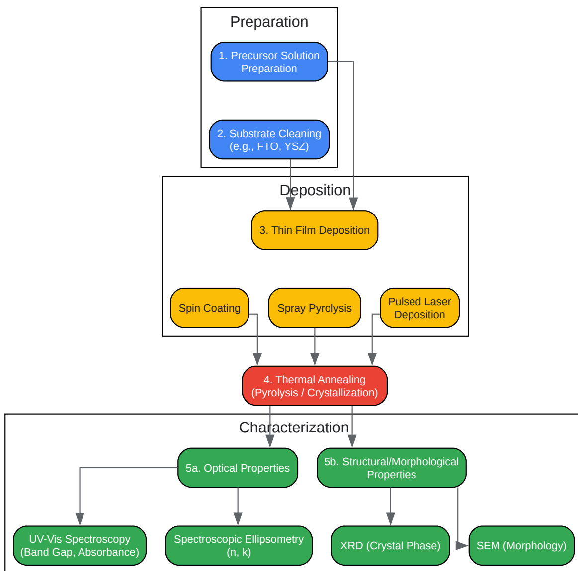
General Workflow for BiVO 4 Thin Film Synthesis & Characterization

Reproducible synthesis and accurate characterization are paramount for developing high-performance BiVO 4 thin films. The following sections detail common experimental procedures.