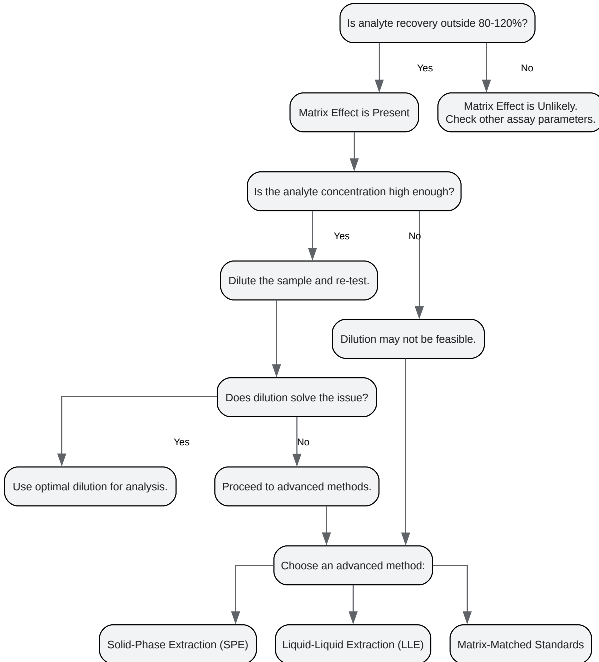
Decision Tree for Troubleshooting Matrix Effects

Click to download full resolution via product page