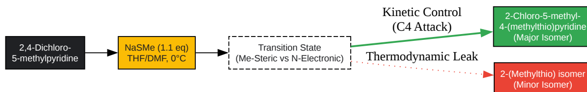
Figure 1: Regioselective Synthesis via SNAr. C4 attack is electronically favored despite C5 sterics.

Click to download full resolution via product page