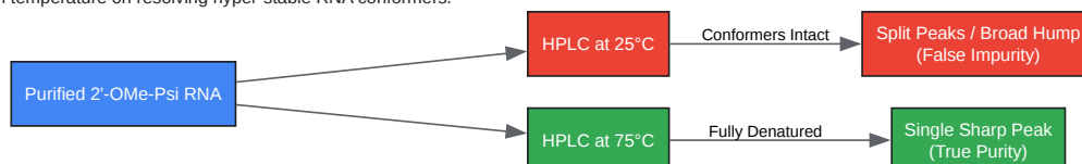
Figure 2: Impact of column temperature on resolving hyper-stable RNA conformers.

Click to download full resolution via product page