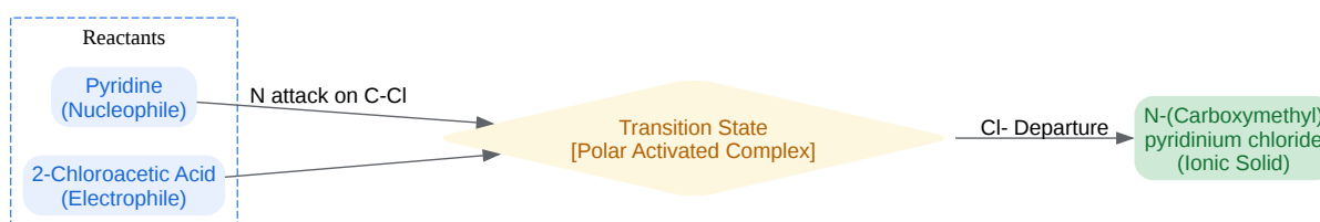
Figure 1: SN2 Mechanism of Pyridine Alkylation under Solvent-Free Conditions.

Click to download full resolution via product page