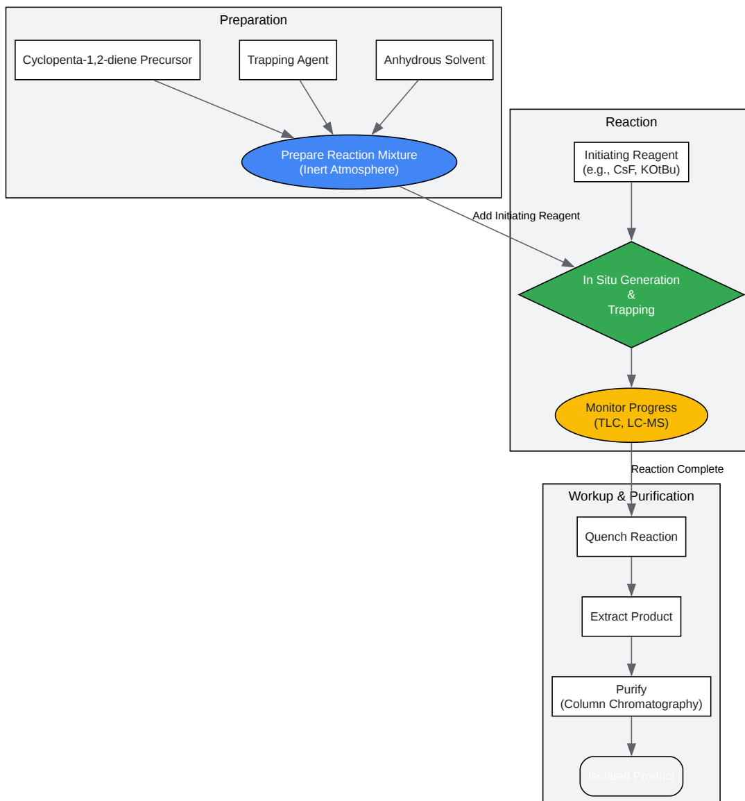
Experimental Workflow for Cyclopenta-1,2-diene Trapping