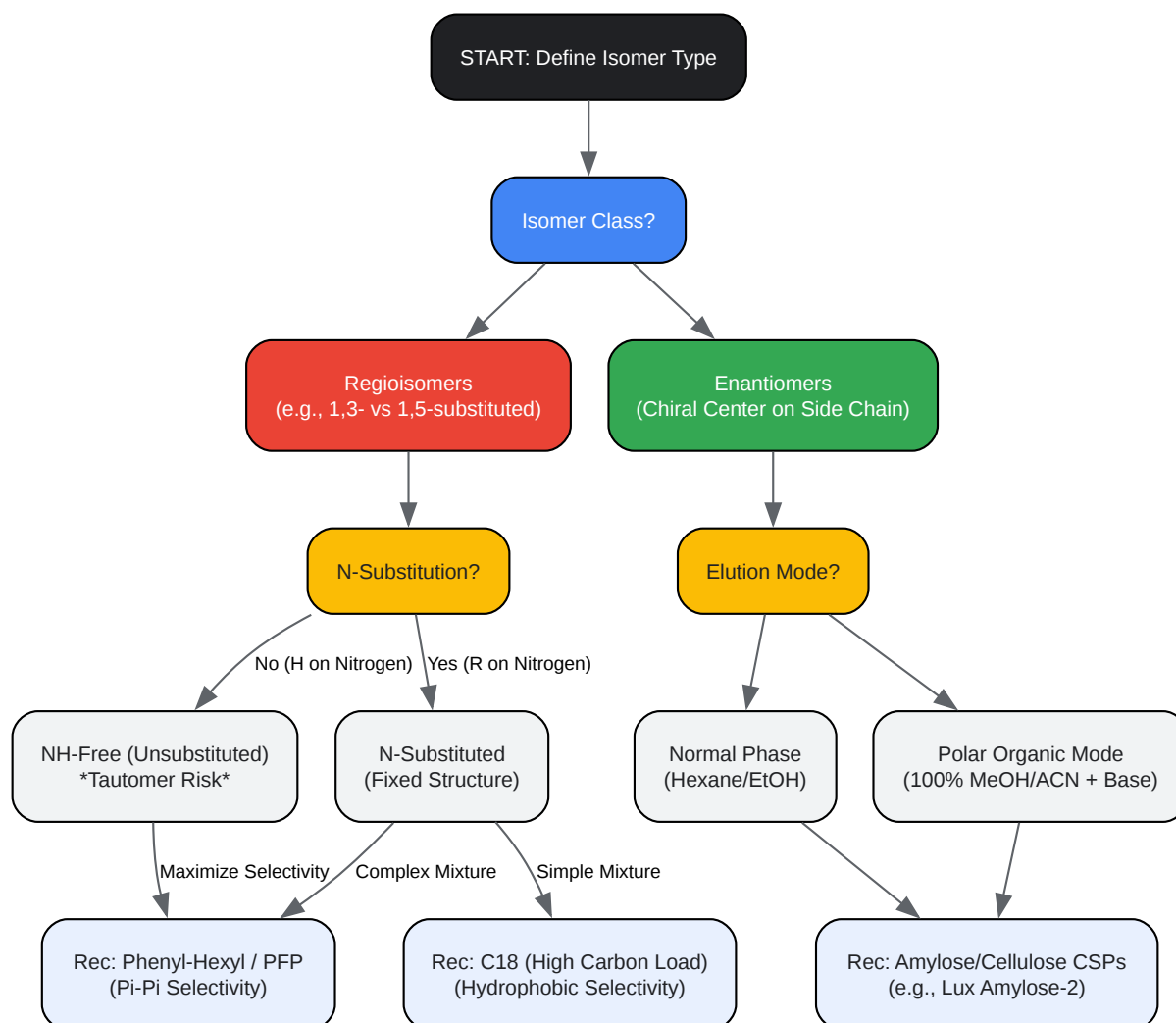
Diagram 1: Method Development Decision Tree

Click to download full resolution via product page