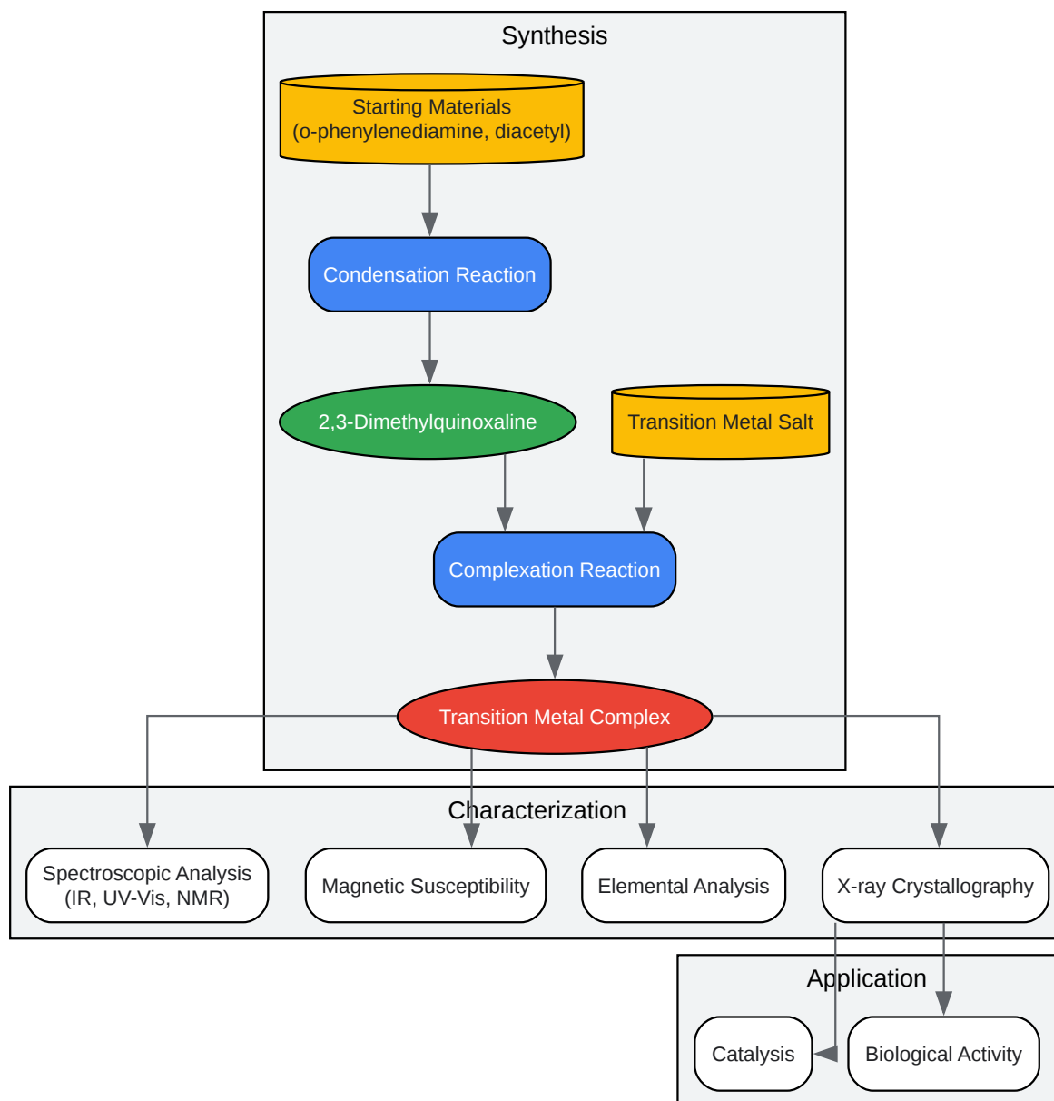
Experimental Workflow for Synthesis and Characterization

Click to download full resolution via product page