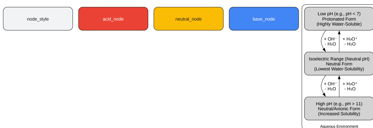
Figure 1: Ionization States of 3-Amino-3-(3-methoxyphenyl)propan-1-ol

This pH-dependent behavior is fundamental to predicting absorption in the gastrointestinal tract and for developing parenteral formulations.[6]