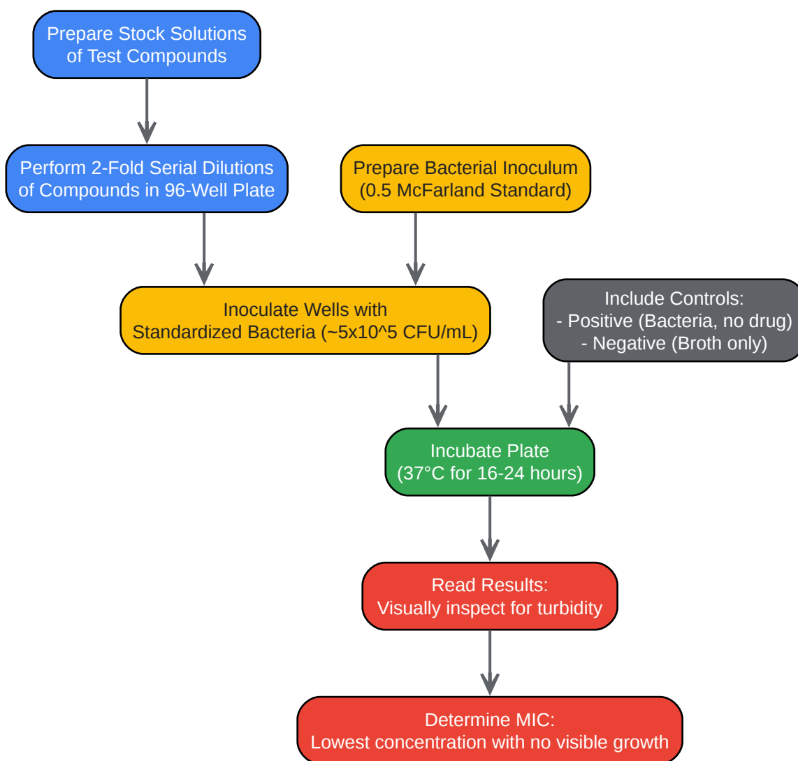
Figure 2: Broth Microdilution MIC Assay Workflow

Click to download full resolution via product page