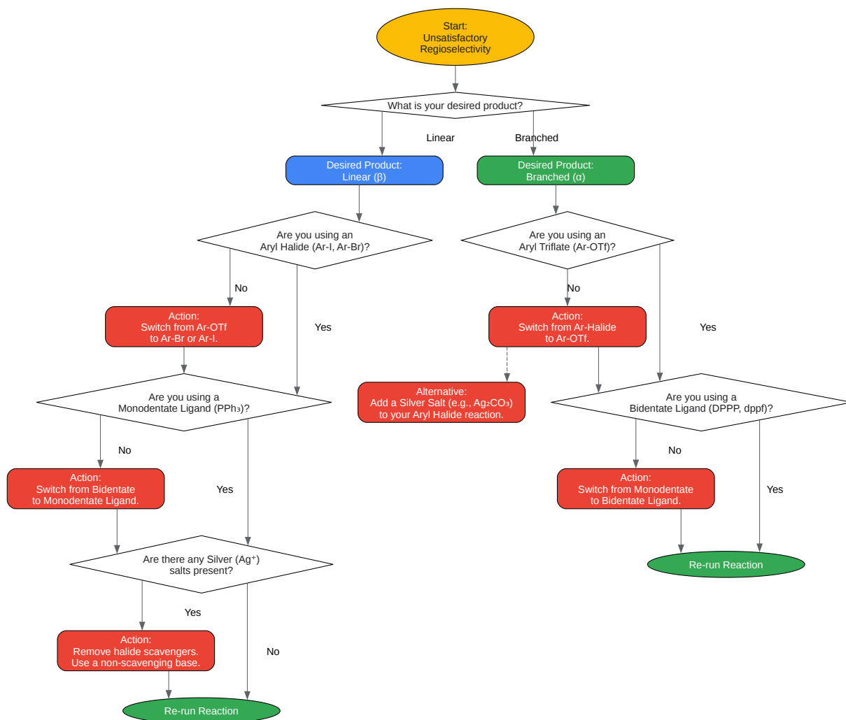
Figure 2: Troubleshooting Workflow

Click to download full resolution via product page