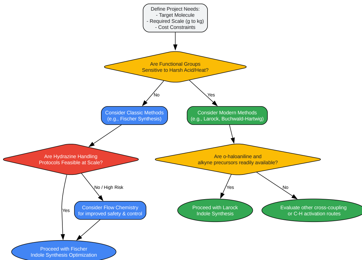
Diagram 1: Scale-Up Strategy Decision Workflow

Click to download full resolution via product page