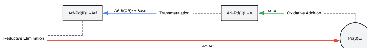
Figure 1: The Catalytic Cycle of the Suzuki-Miyaura Reaction

The generally accepted mechanism for the Suzuki-Miyaura coupling proceeds through a catalytic cycle involving a palladium(0) active species. [1][3][4] The cycle comprises three fundamental steps: oxidative addition, transmetalation, and reductive elimination.