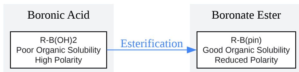
Diagram 2: Boronic Acid vs. Boronate Ester for Improved Solubility

Click to download full resolution via product page