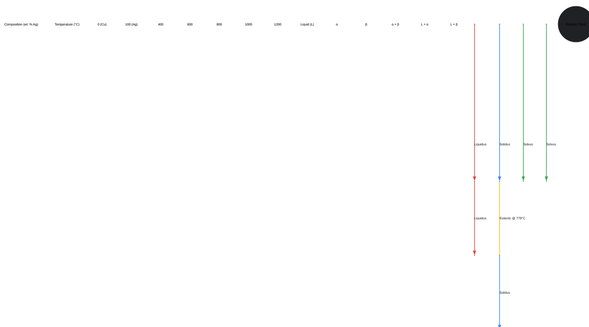
Figure 1: Copper-Silver Phase Diagram

Click to download full resolution via product page