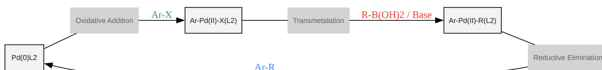
Diagram 1: Suzuki-Miyaura Catalytic Cycle

Click to download full resolution via product page