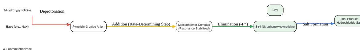
Figure 1: SNAr Mechanism for 3-(4-Nitrophenoxy)pyrrolidine Synthesis

Below is a diagram illustrating the accepted reaction mechanism.