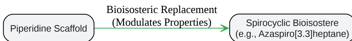
Diagram: Bioisosteric Replacement of Piperidine

Click to download full resolution via product page