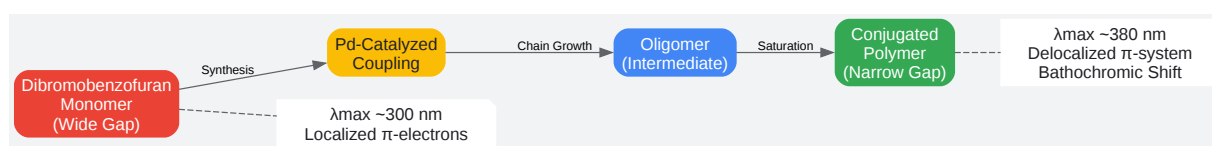
Diagram 1: Electronic Transition Pathway The following diagram illustrates the energy shifts occurring from the monomeric state to the conjugated polymer state.

Click to download full resolution via product page