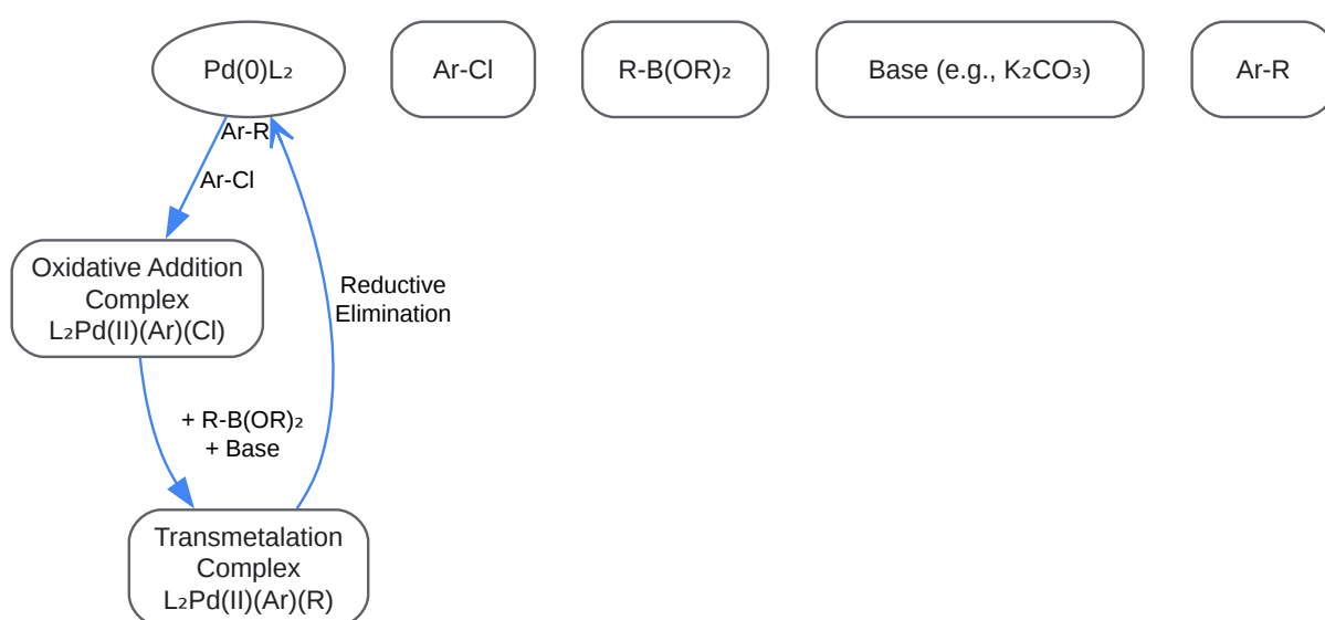
Figure 2: Catalytic Cycle of the Suzuki-Miyaura Coupling

Mechanistic Cycle: The reaction proceeds through a well-established catalytic cycle involving three key steps: (1) Oxidative Addition of the C-Cl bond to a Pd(0) species, (2) Transmetalation where the organic group is transferred from the boron reagent to the palladium center, and (3) Reductive Elimination to form the new C-C bond and regenerate the Pd(0) catalyst.[7]