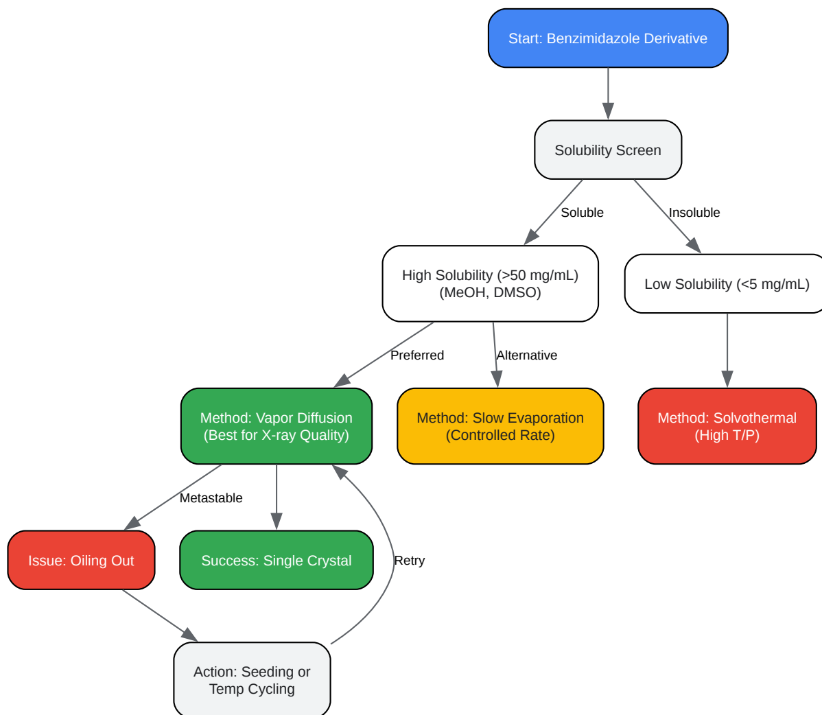
Diagram 1: Crystallization Strategy Decision Tree

Click to download full resolution via product page