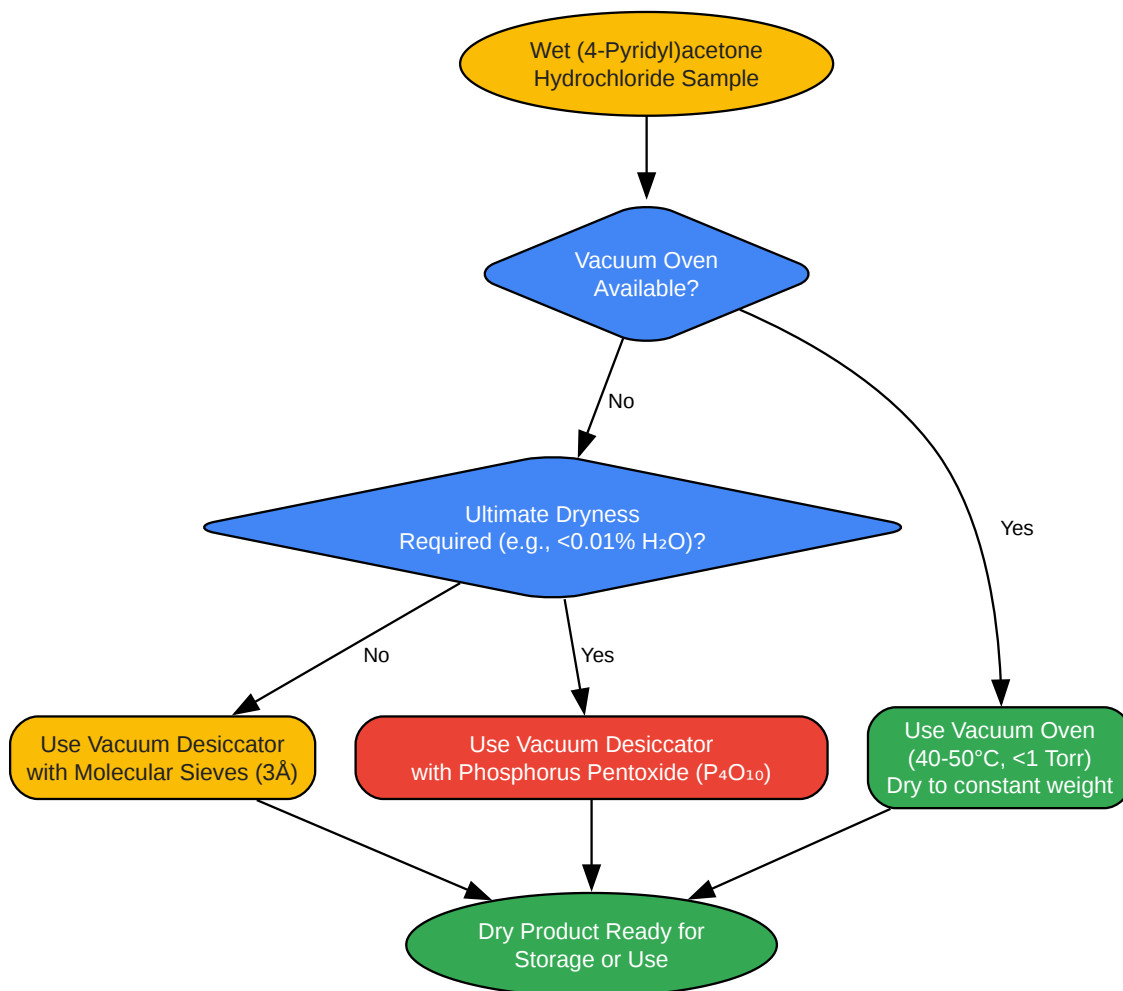
Diagram 1: Decision Flowchart for Drying Method Selection

Click to download full resolution via product page