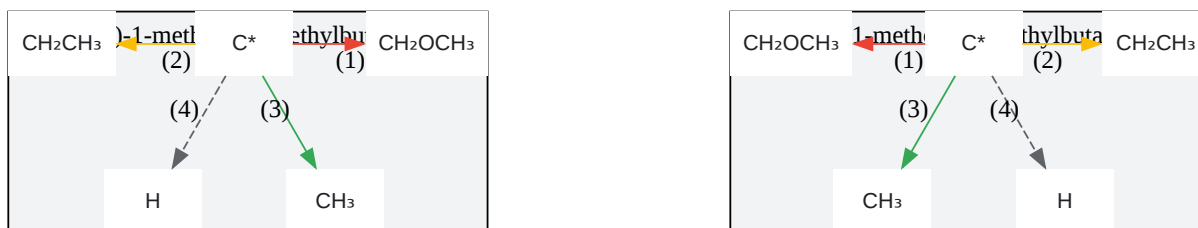
Figure 1. Enantiomers of 1-methoxy-2-methylbutane with Cahn-Ingold-Prelog priorities.

The tetrahedral arrangement of these four different groups around the C2 carbon results in two distinct spatial arrangements that are mirror images of each other. These non-superimposable mirror images are known as enantiomers.