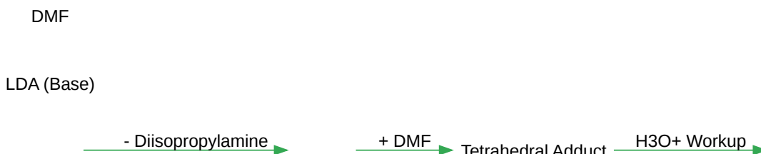
Diagram 2: Reaction Mechanism This diagram illustrates the key steps of the directed ortho-metalation and formylation.