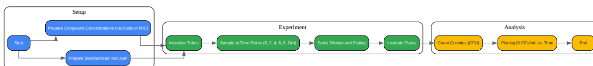
Diagram: Time-Kill Kinetics Workflow

Click to download full resolution via product page