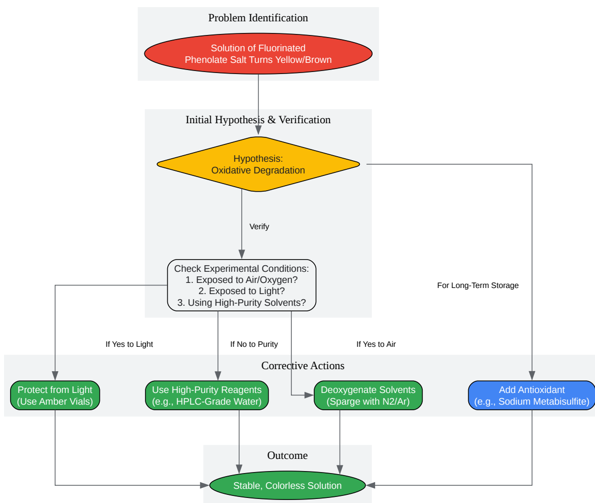
Diagram 4.1: Troubleshooting Workflow for Solution Discoloration

Click to download full resolution via product page