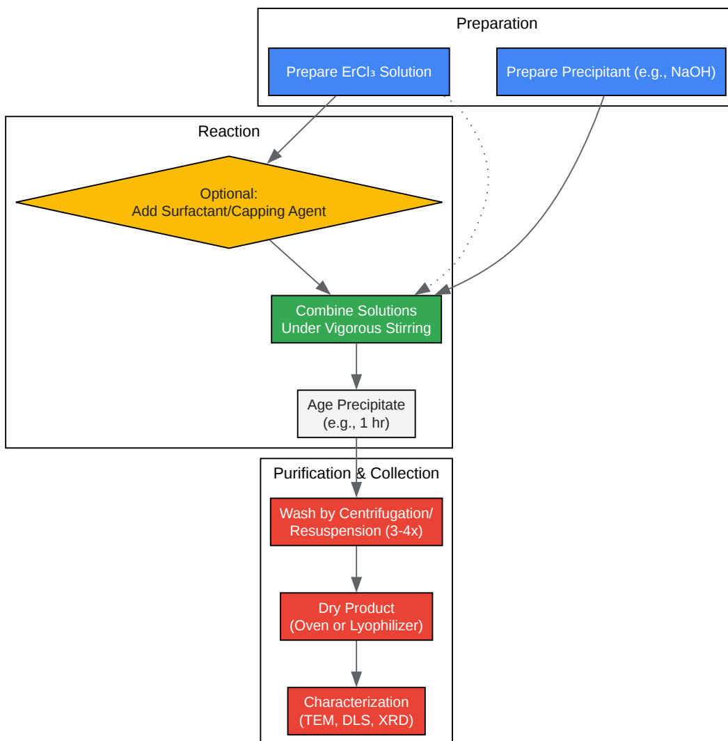
Diagram 1: General Experimental Workflow