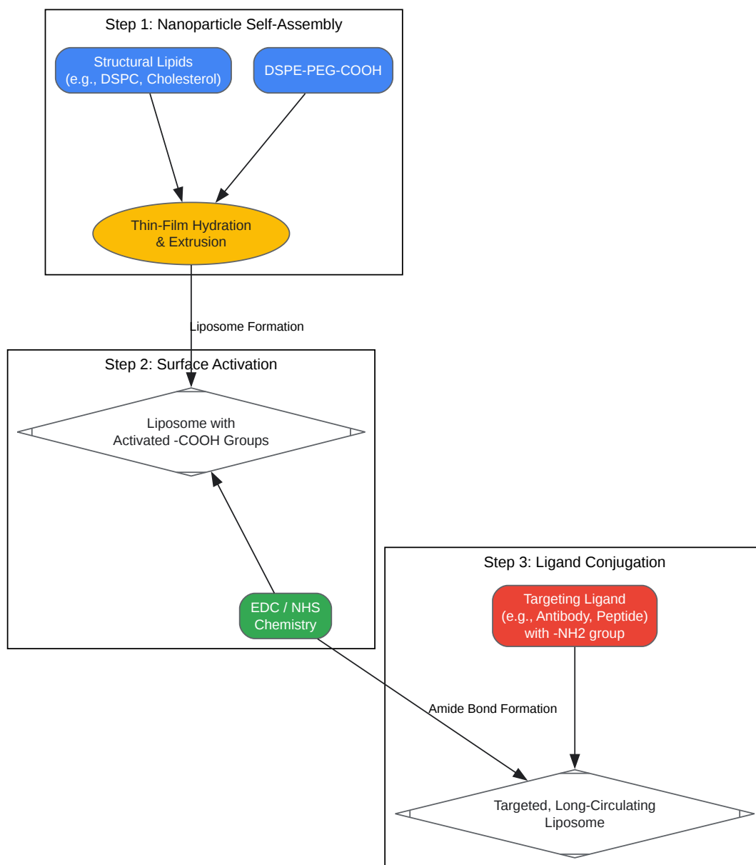
Diagram 2: Workflow for Creating a Targeted Liposomal Nanocarrier

Click to download full resolution via product page