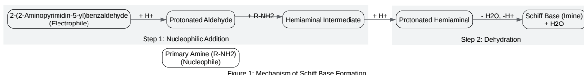
Figure 1: Mechanism of Schiff Base Formation

Click to download full resolution via product page