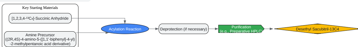
High-level synthetic workflow for Desethyl Sacubitril-13C4.

Click to download full resolution via product page