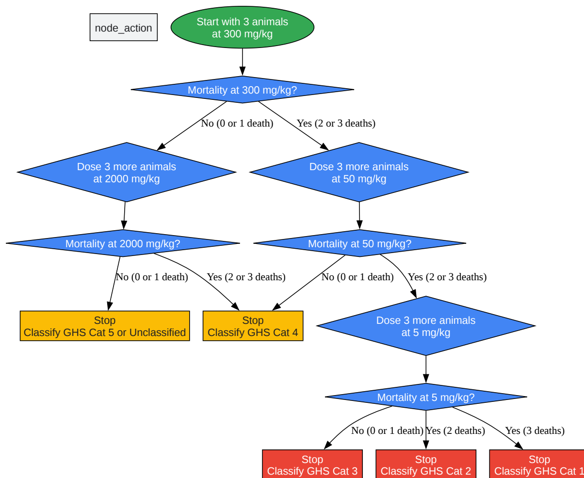
Figure 2: OECD 423 Acute Toxic Class Method Logic

Click to download full resolution via product page