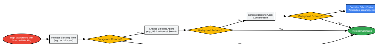
Diagram 2: Decision Tree for Blocking Optimization

Click to download full resolution via product page