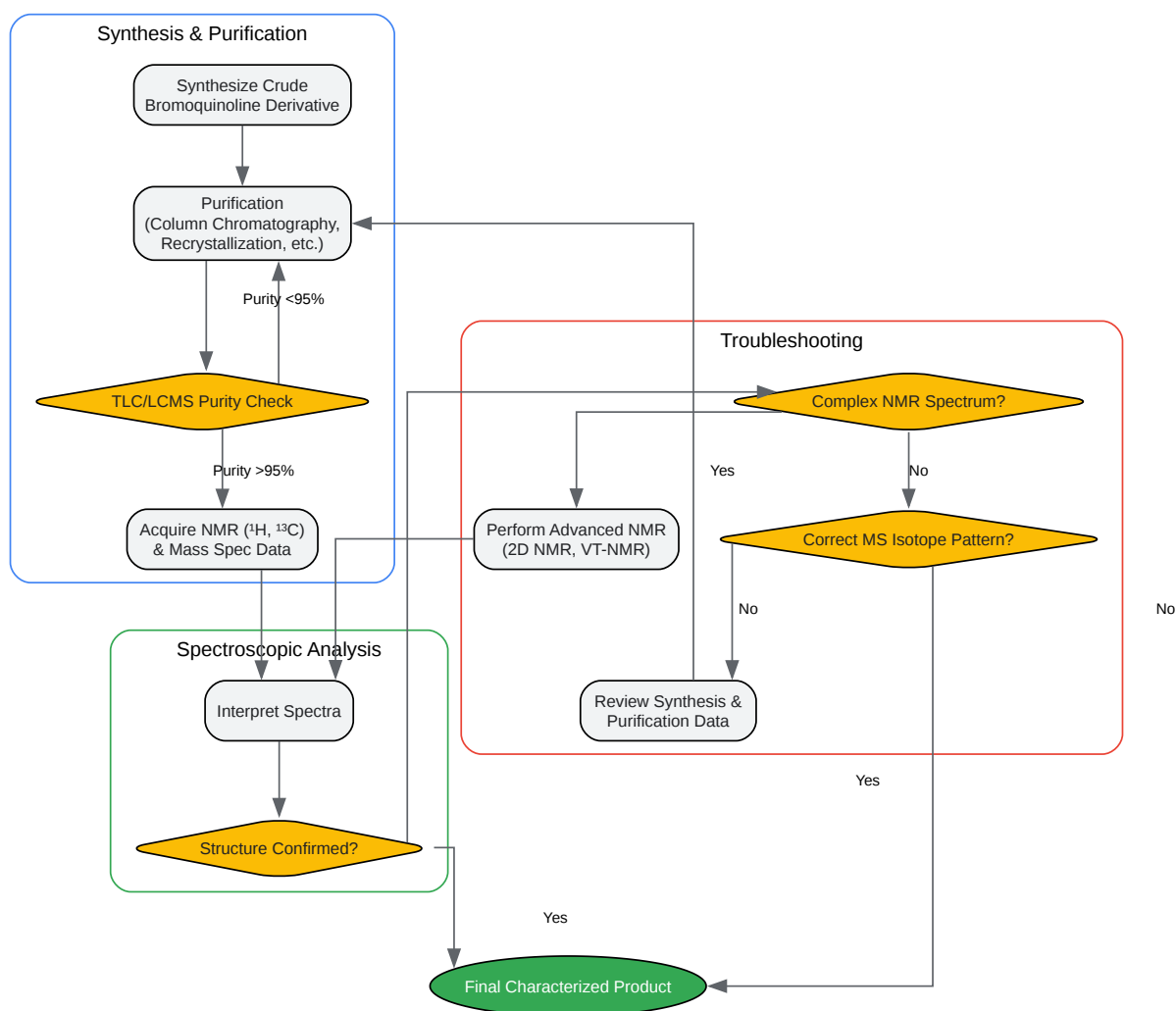
Workflow for Bromoquinoline Characterization

Click to download full resolution via product page