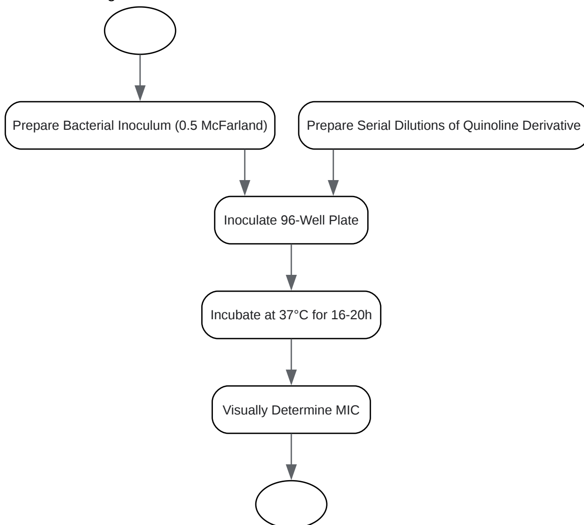
Fig. 2: Broth Microdilution Workflow for MIC Determination

Click to download full resolution via product page