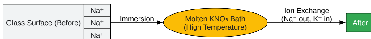
Diagram 3: Mechanism of Ion-Exchange Strengthening

Click to download full resolution via product page