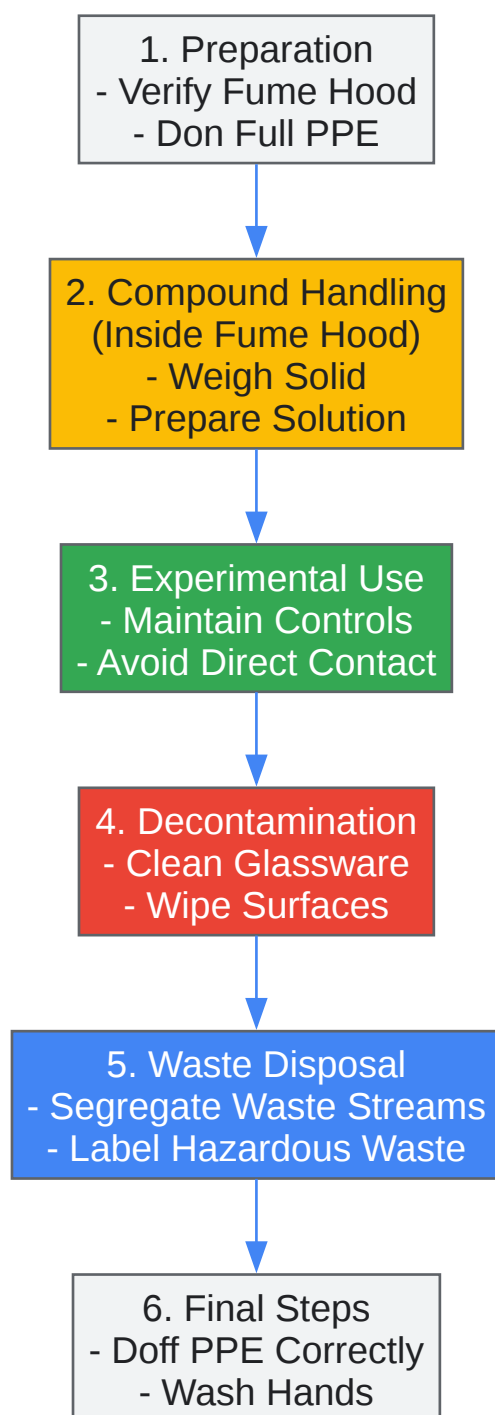
Figure 1: Safe Handling Workflow

Click to download full resolution via product page